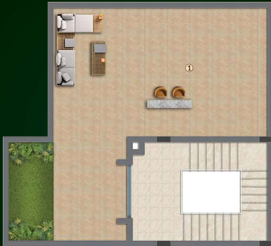
TERRACE TYPE B FLOOR