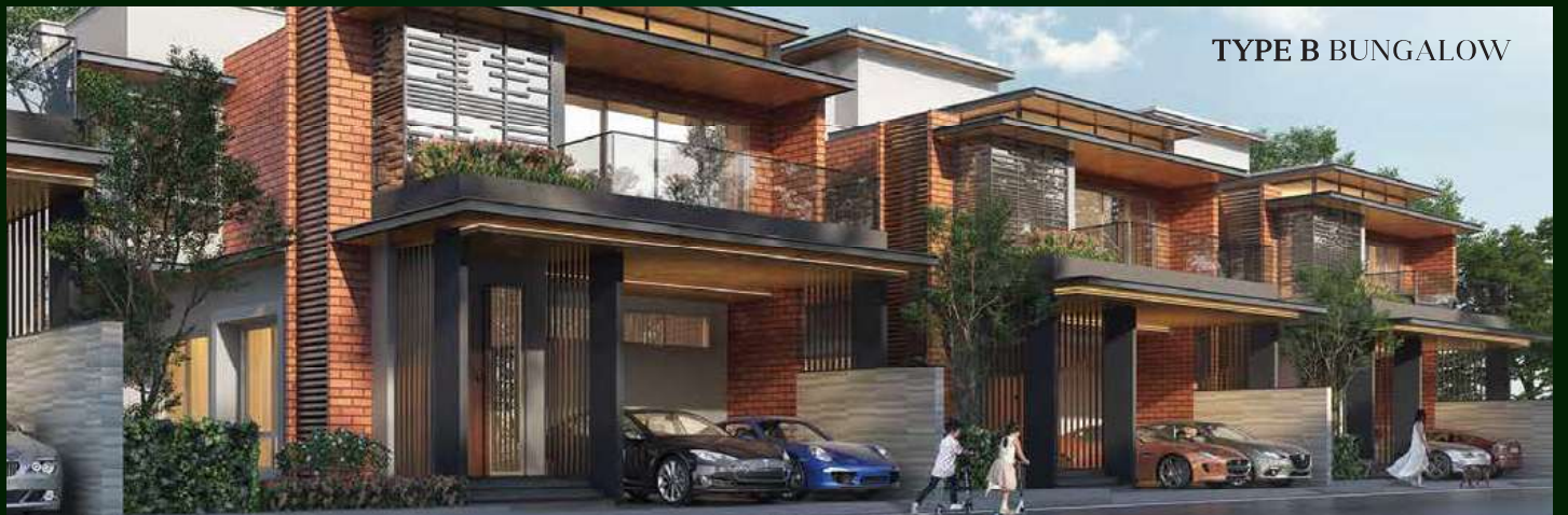
TYPE B BUNGALOW