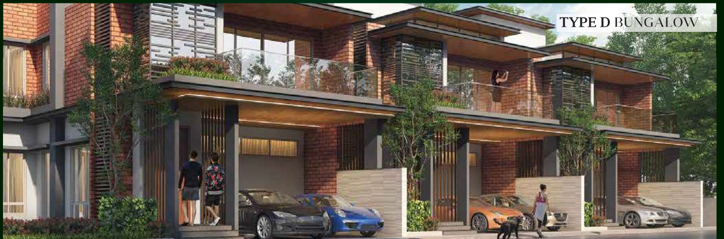
TYPE D BUNGALOW