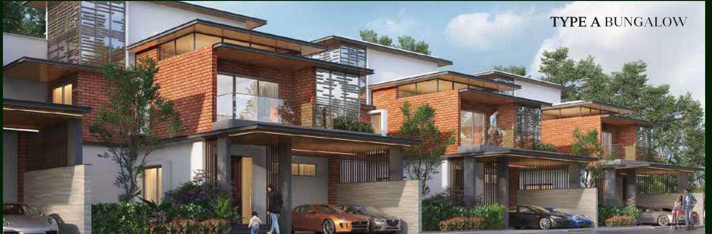
TYPE A BUNGALOW