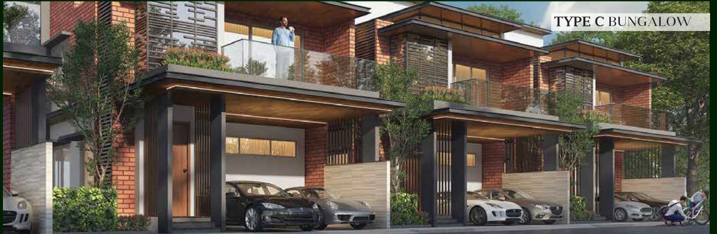
TYPE C BUNGALOW