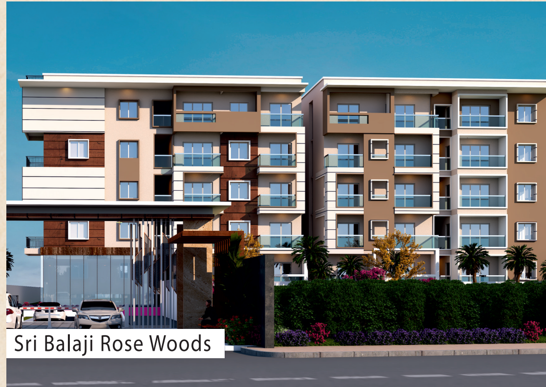
Sri Balaji Rose Woods