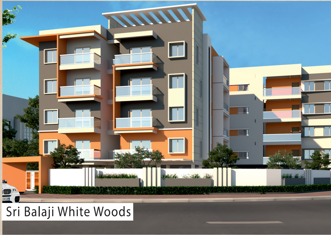
Sri Balaji White Woods